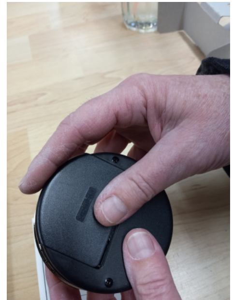
Push up on the cover to create a gap