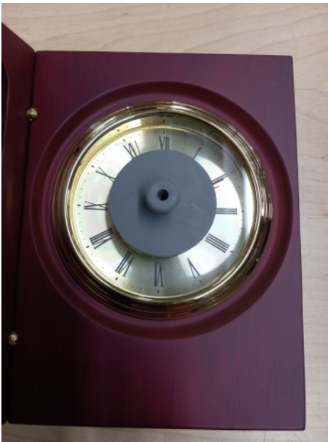
Stick enclosed suction cup to front of clock