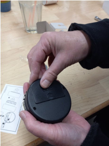
Gently lift up and pull toward center of clock to pivot it up and remove