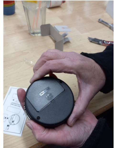
Put cover plate in slot, lower down and slide toward center of clock to lock in place