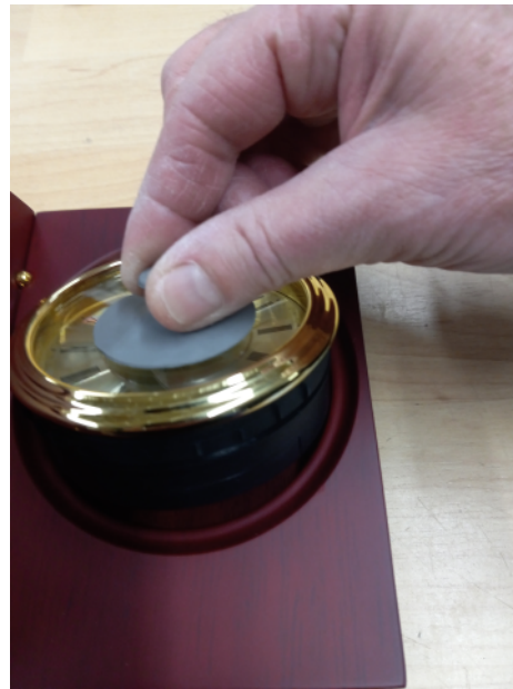
Pull up as you rock it back and forth to remove