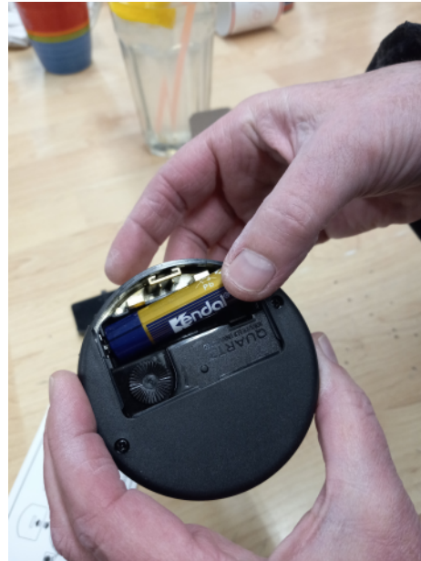
Remove and Insert new battery