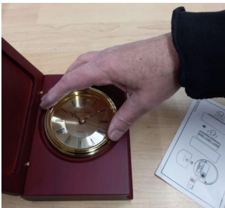
Finally, reinsert into the clock and enjoy!